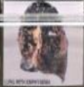
ALL WITH EMPHYSEMA